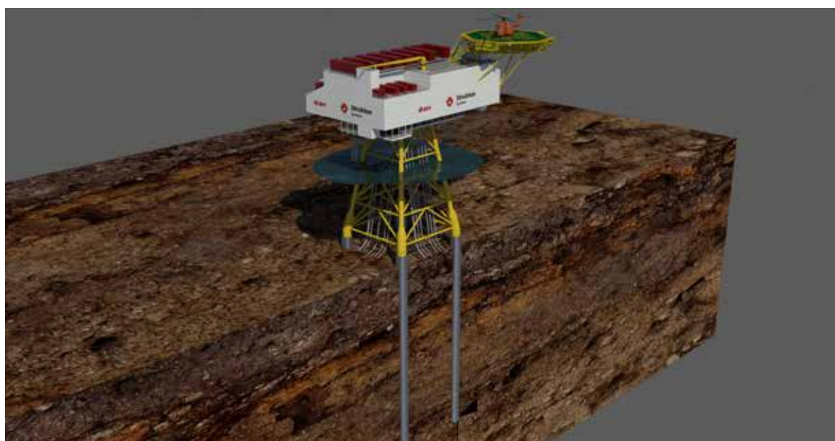
KCI's feasibility study for substructure of a substation