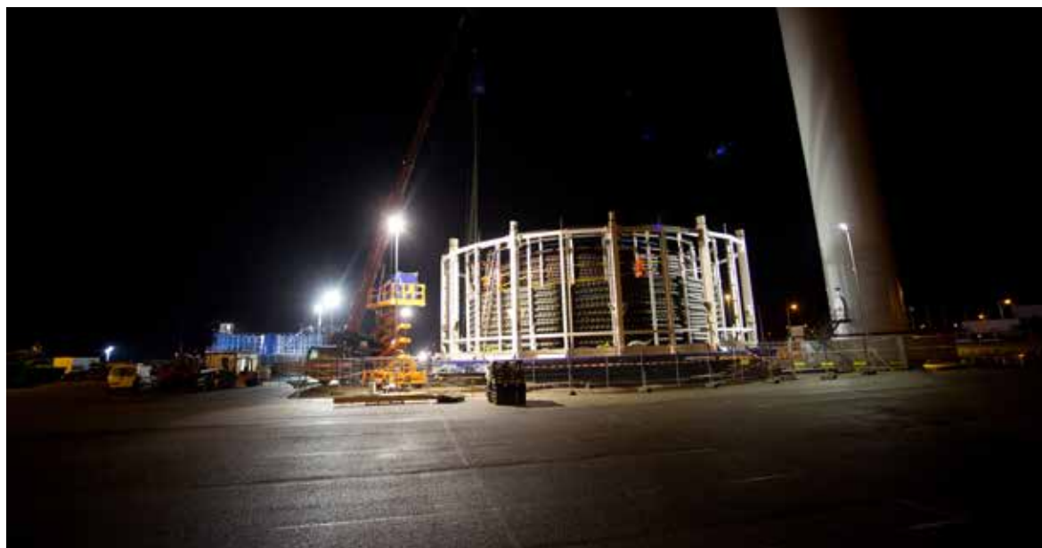
RentOcean's 3000T Turntable loading cable in Eemshaven for offshore wind farm project

100 percent goodwill has been taken into account when Oceanteam increased its ownership from 50 percent to 70 percent in April 2010 through a conversion of debts. Goodwill is therefore not affected for this acquisition. Consideration is not reported in this interim report due to commercial reasons.