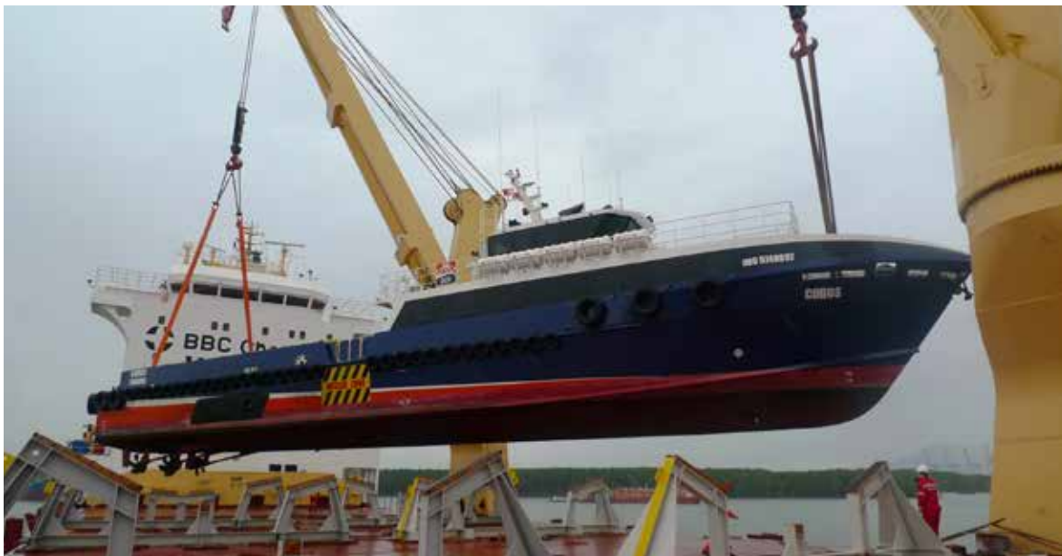
FSV's Iacos and Cobos lifted onto vessel for transport to Mexico

In accordance with the Accounting Act § 3-3a Oceanteam Shipping confirms that the financial statements have been prepared under the assumption of going concern. This assumption is based on income forecasts for the years 2015 – 2016 and the Group's long-term strategic forecasts. The annual report for 2013 is available on www.oceanteam.no